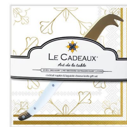
Cocktail napkins and mini cheese knife gift set

The new Bellini cocktail napkins, guest napkins and charger placemats with metallic gold accents.