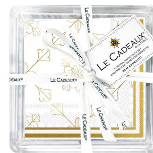
Cocktail napkins in acrylic holder gift set