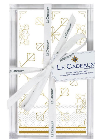
Guest napkins in acrylic holder gift set