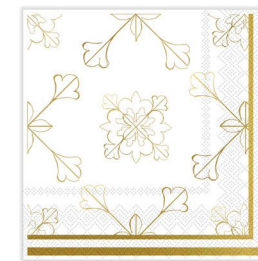
Double-sided cocktail napkins