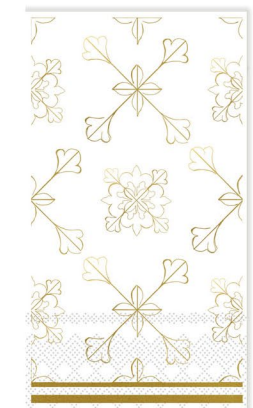
Double-sided guest napkins